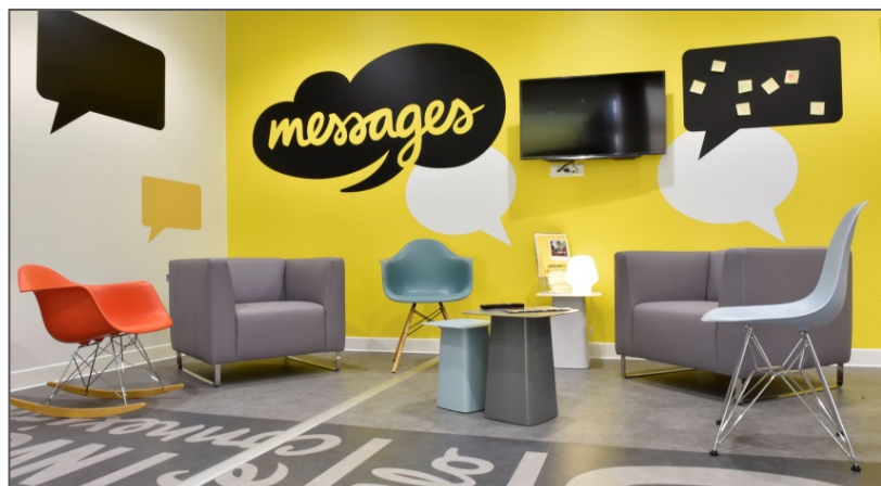
Interior space of La Suite-Necker