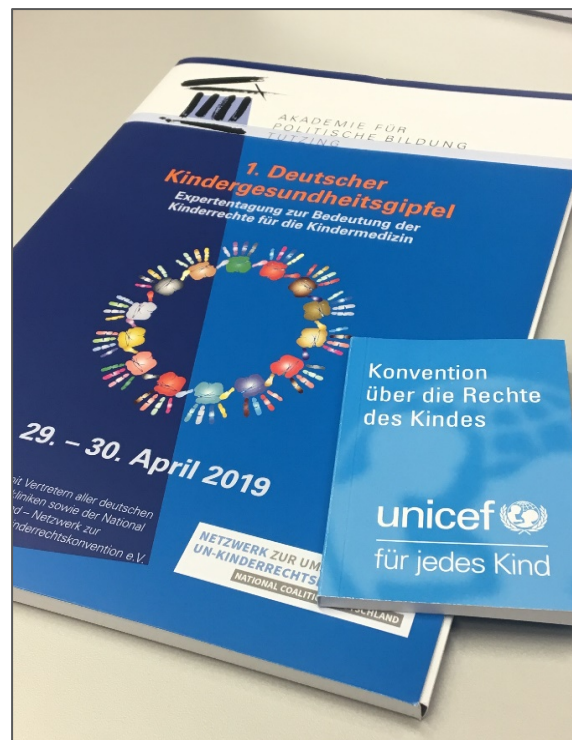
Conference materials from 1 st Children's Health Summit in Munich, Germany