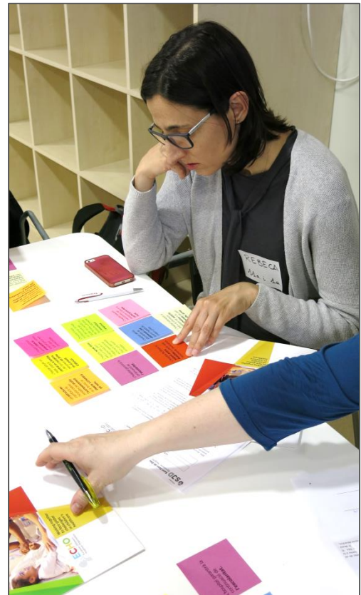
Participants in the design thinking workshop on child rights

To learn more about nominal group techniques, including how to run a group, see "Gaining Consensus Among Stakeholders Through the Nominal Group Technique" from the Centers for Disease Control and Prevention, available at: https://www.cdc.gov/healthyyouth/evaluation/pdf/brief7.pdf .