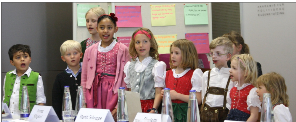
Children's choir at the 1 st German Children's Health Summit

To create an opportunity for patients to provide feedback on their hospital experience and to guide the hospital's work around supporting the rights of children, Dr. von Hauner Children's Hospital in Munich, Germany, established a Child's Rights Working Group (AG Kinderrechte) in March 2019. Formation of the group was partly motivated by survey results showing that German paediatricians reported low levels of implementation and support of child rights in their practice settings (see Section 3 for additional details). AG Kinderrechte works to jointly develop concrete proposals for better implementation of the rights of children and young people and is currently producing a child-friendly version of the von Hauner Charter on Rights of Children in Hospital. The charter will be distributed as a book to all patients. The group also presented at the 1 st German Children's Health Summit in April 2019 where they received positive feedback from attendees. They hope this rights-based approach will be a model for other youth advisory groups in Germany.