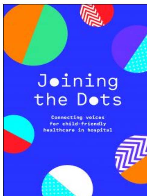
Joining the Dots Report Cover

Additional information: To obtain a full copy of the report visit the Ombudsman for Children's Office at: https://www.oco.ie/childrens-rights/consulting-with-young-people/joining-the-dots/ .