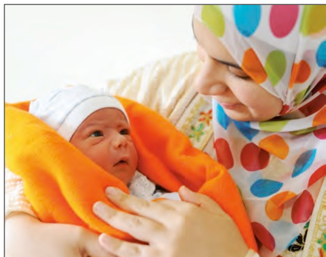
A Muslim mother and her child

In response to a growing international patient population, in 2019 Sant Joan de Déu conducted a needs assessment to identify gaps in training in cultural competence. The results of this analysis are being used to develop staff training to provide optimal care to the entire patient population, regardless of their country of origin, language, or culture.