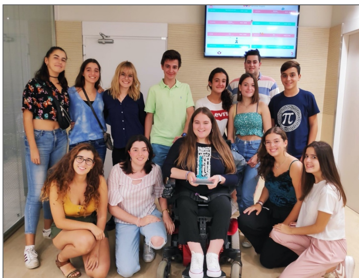
Barcelona KID Youth Scientific Council 2019

Another important way KDIS Barcelona contributes to the research process is by ensuring that all information about clinical trials is presented in a way that is understandable to patients and families, allowing them to make informed decisions about participation.