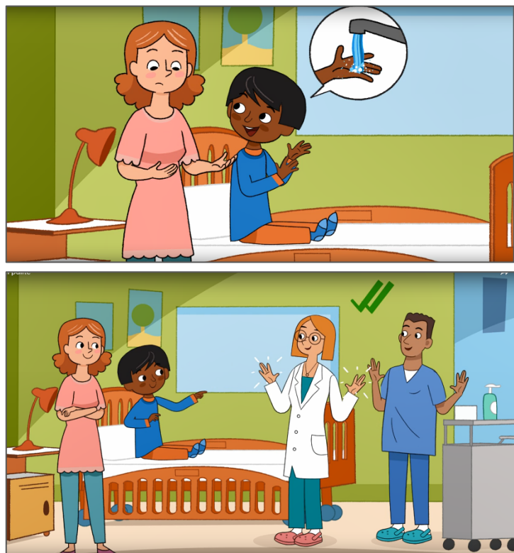
Screen shots from "In terms of safety, we are a great team" safety videos developed at Meyer Children's Hospital

Collaborating Center in Human Factors and Communication for the Delivery of Safe and Quality Care. The videos highlight the active role that children and families can play in four common sources of harm: lack of information, poor hand hygiene, interruptions in therapy, and issues at discharge. Videos are shown in waiting rooms and play spaces throughout the hospital with simple and clear messages that can be understood by children and families who do not speak Italian.