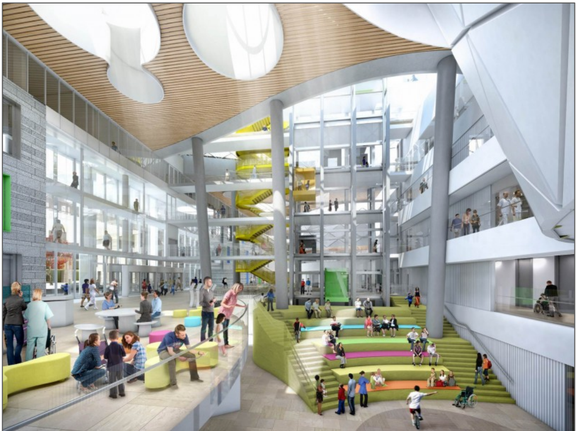
Concourse concept of new Children's Health Ireland hospital

Children's University Hospital Latvia in Riga is also incorporating play into their planning and construction process. As part of their hospital redesign they will be introducing a new play space into the waiting area of the hospital.